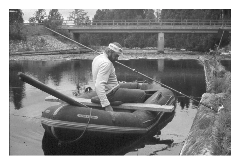
Fig. 5. A discharge measurement in Saramojoki River in Northern Karelia in the 1970s.

Groundwater had gained more importance in water supply, and a new observation network of 54 groundwater stations was established in the mid-1970s by Jouko Soveri. This network produced data concerning groundwater quantity and quality, their natural variations and the geohydrological factors affecting groundwater status. Results from the first decade of observations were analysed in Soveri's PhD thesis in 1985. – Risto Lemmelä also dealt with groundwater issues in his thesis in 1990.