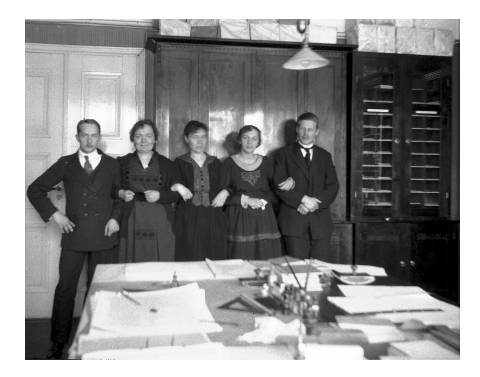
Fig. 3. Staff members of the Hydrographic Office in 1920s.