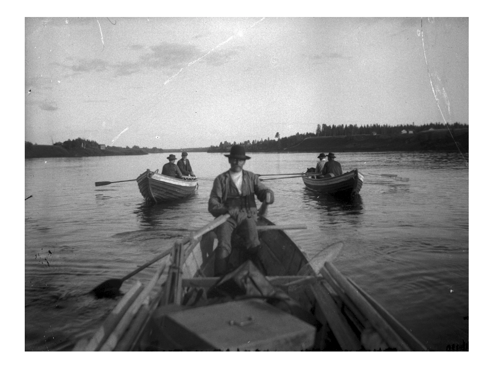
Fig. 2. The field team of the Hydrographic Office on their way to a discharge measuring site in Kainuu in 1910.