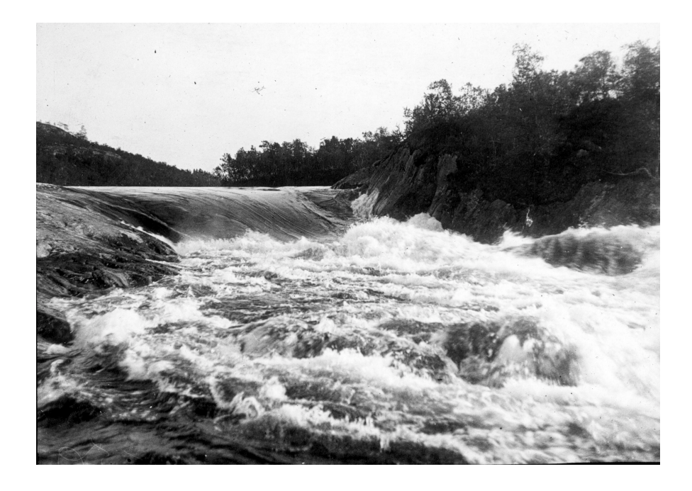
Fig. 4. Many sites of today's hydropower stations were photographed in their natural states by the Hydrographic Office, including Jäniskoski in the River Paatsjoki. A powerplant was built there during the Second World War; it is now located in the Russian territory.

The observational data were published in yearbooks from 1912 onwards. Monographs were also printed in the first years of the Office on the Vuoksi and Kymi rivers: the latter was an extensive work on 470 large-size pages and some 80 plates. The results of the precise levelling necessary for the determination of elevations had been worked