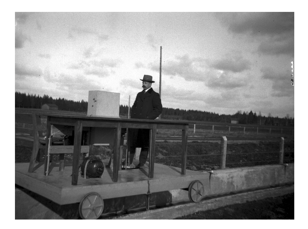
Fig. 1. The calibration installation at Tikkurila in 1913.